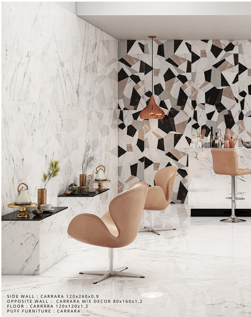
SIDE WALL : CARRARA 120x260x0,9 OPPOSITE WALL : CARRARA MIX DECOR 80x160x1,2 FLOOR : CARRARA 120x120x1,2 PUFF FURNITURE : CARRARA