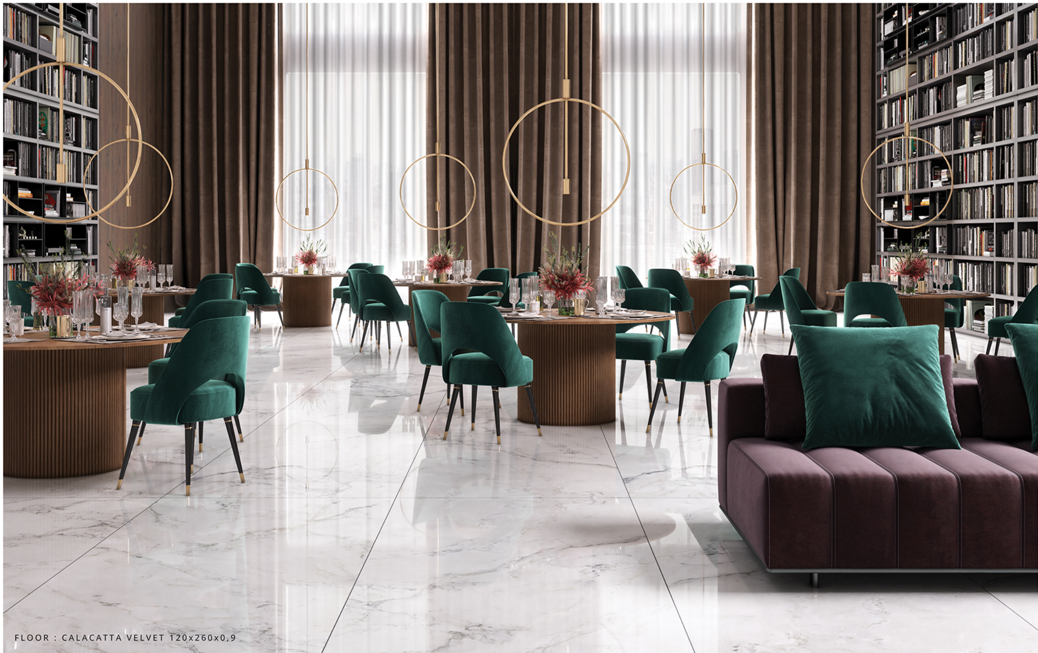
FLOOR : CALACATTA VELVET 120x260x0,9